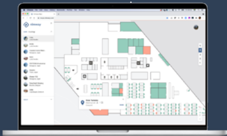
Mobile and web apps