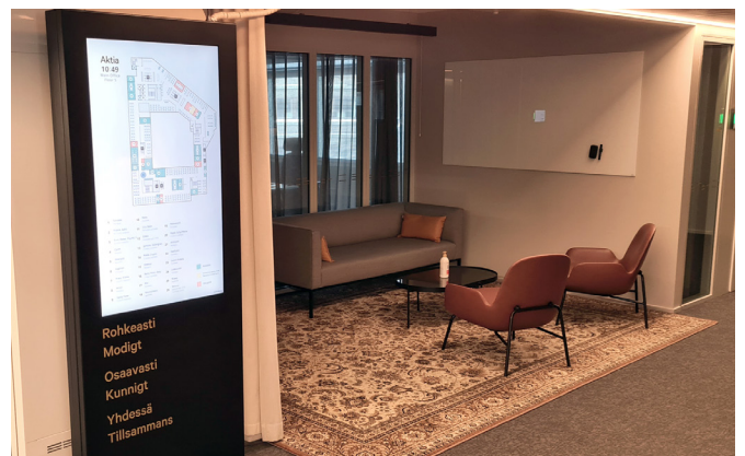
DIGITAL FLOORPLANS make it easy for employees and guests to find their next meeting or workspace.