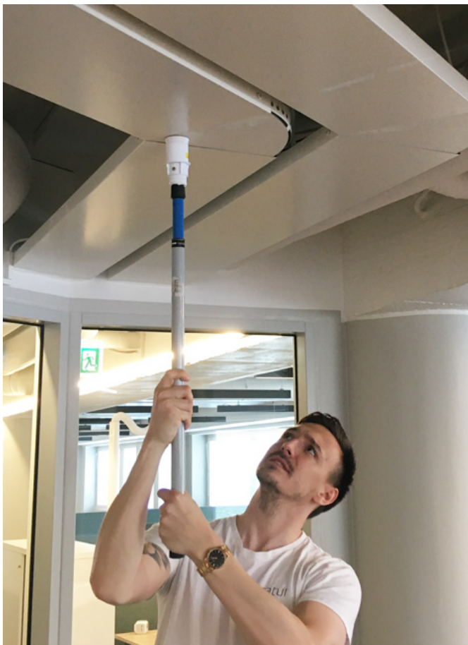
STRATUR'S EXPERTS install beacons at Aktia's new HQ in Helsinki, Finland.

Thanks to a combination of Stratur's experts on site in Helsinki and Sony's experts supporting remotely, the job went smoothly. But, as with every installation, there were a few minor hitches. "For example, there was one small area where the indoor positioning didn't work quite as planned," explains Jani, "so we talked to Lund and decided to add a couple of extra beacons, and that solved it."